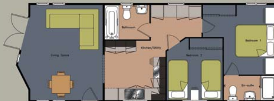
Overall size: 42 x 16ft. 2 Bed en-suite Gross Floor Area: 650sqft (60.30sqm)