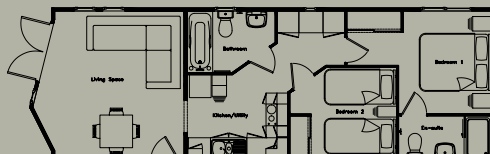
Overall size: 42 x 14ft. 2 Bed en-suite Gross Floor Area: 571sqft (53.02sqm)