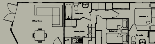
Overall size: 44 x 13ft. 2 Bed en-suite Gross Floor Area: 557sqft (51.72sqm)