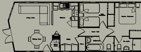
Overall size: 42 x 16ft. 2 Bed en-suite Front Lounge Gross Floor Area: 653sqft (60.63sqm)