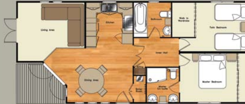
Overall size: 45 x 20ft. 2 Bed en-suite Front Lounge Gross Floor Area: 825sqft (76.6sqm)