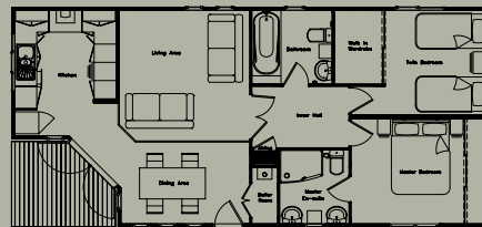
Overall size: 43 x 20ft. 2 Bed en-suite Centre Lounge Gross Floor Area: 785sqft (72.89sqm)